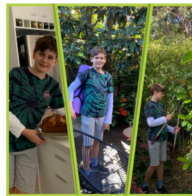
Roman (5A): Marble cake baking, meditation outside and gardening