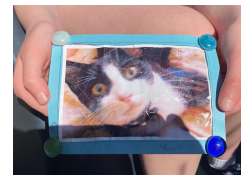
Aurora (6A): Cat craft and cooking