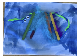
India (PA): Watercolour craft